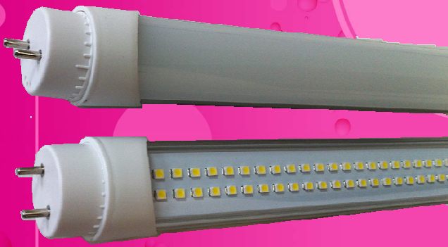
Special LED Tube with pink color For meat, sausage, fruit Makes them look more fresh and appetizing

With the latest LED technology, LeuchTek offers the new and special LED tube for the applications such as meat/ butcher, fruit, vegetable etc food industries.