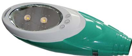
ST01 series 30-60W