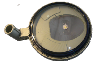
ST03 series 30W