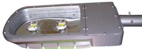
ST02 series 30-90W